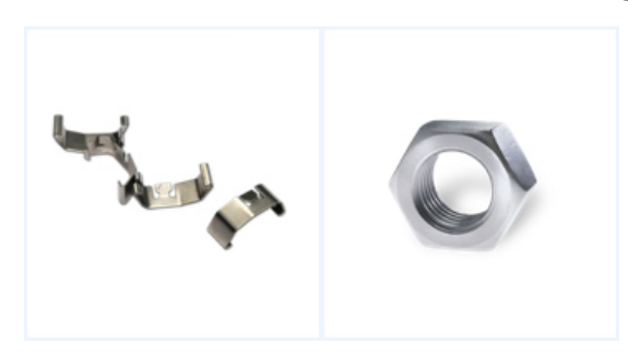
Non metrical threaded parts